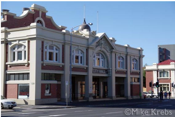
Hobart City Hall

The event is to be held at The Hobart City Hall that is located in Macquarie Street. Hobart and will commence at 9.00am on 14 th April and finish at 6pm on Sunday 15 th . A detailed program and competitor draw will be sent to participating instructors once entries have been received.