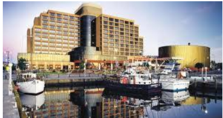
Hobart Waterfront and Grand Chancellor Hotel

Hobart airport is 17km from the city, various mechanisms are available to get from the airport to the city including a regular airporter bus which meets all flights into Hobart and drops at all hotels as well as some charter operators. Cost is between $10 and $20. Taxi fare to the city is about $50. Accommodation can be found in Hobart and North Hobart with the venue being in Central Hobart, 2 mins from the Hobart waterfront that has many restaurants and lots of high quality accommodation. There are also several Backpacker hotels in Hobart central. Like Wellington, Hobart is a small city and most accommodation in the city is walking distance to the venue.